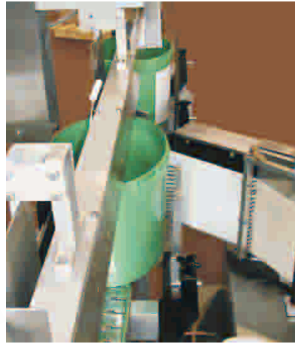
Label transfer at vacuum plate

Pails are metered into the E 36 one at a time. Pressure sensitive labels are fed from a roll into position on a vacuum plate. As the containers pass the plate, the labels are picked up and firmly "squeeged" into position on the passing pails.